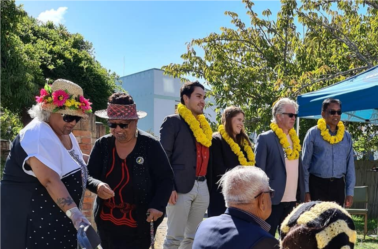
Race Unity Day celebrations 2021